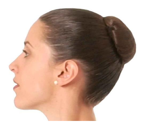
Classical Ballet Bun