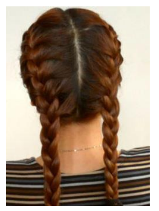
French Braid front must be slicked back