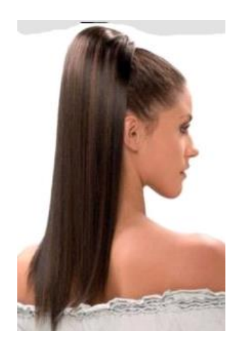
Straight Ponytail use a "Straightener"

High Curly Ponytail - (hairpiece optional)