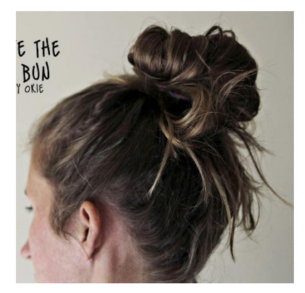
Messy bun - bun pictured Ok, but sides must be slicked back