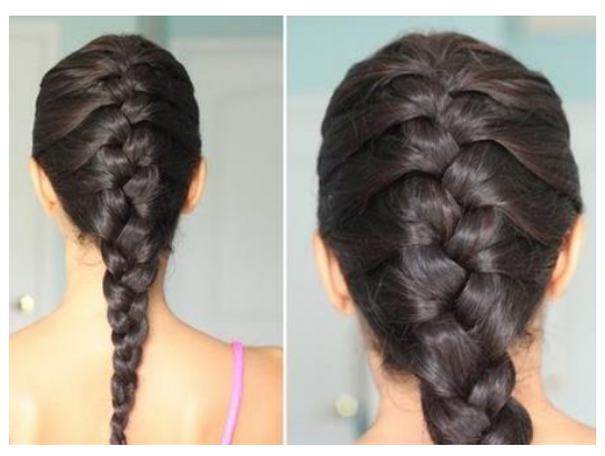
Single French Braid front must be slicked back