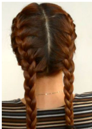
French braid sides must be slicked back