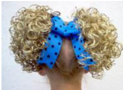
"Pigtails - spirals"

Several parents have ordered from this website and they seem to be reasonably priced and seem to ship quickly if in stock. We suggest the "Youth Spiral Curls" style for the Junior and older students and the "Spiral Pigtales" for the Pre-school & Combo students which would allow for a smaller hairpiece and also two options for hair. We also hear that a local store "All About Dance" or Dancer Den was selling hairpieces last season but not sure about this year or do we know their costs.