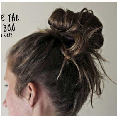
Messy bun - bun is OK but sides must be slicked back