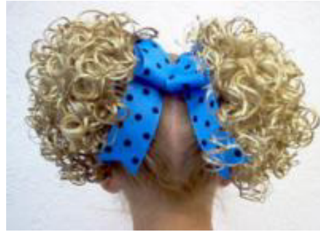
Curly pigtails (hairpiece optional)