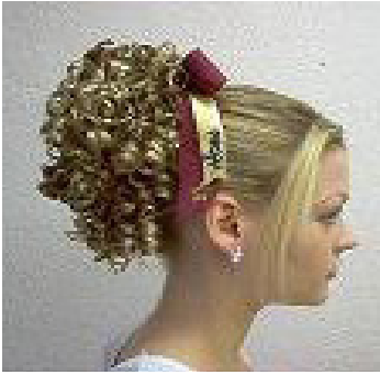
High Curly Ponytail – tight ringlets (hairpiece optional)