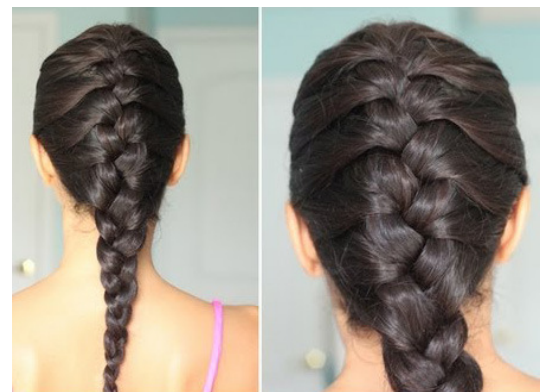
single french braid sides must be slicked back